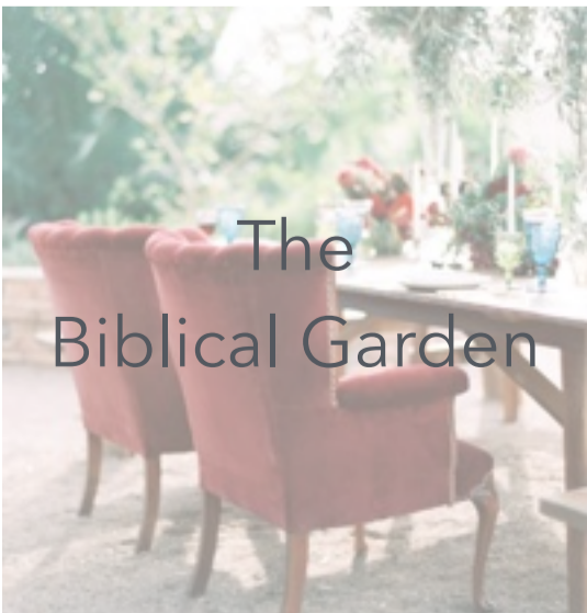
The Biblical Garden

the land is cultured, the trees are mature, and the agriculture is thriving, we are thrilled to announce that The Farm at Agritopia will now host weddings and private events. The Farm at Agritopia offers two inviting spaces of natural beauty: The Biblical Garden and The Orchards.